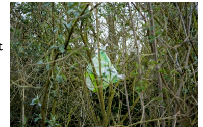
Bag in a tree next to the river

A: It is recommended as it will encourage customers to bring a bag with them. We also suggest setting a price across all retailers because if one shop doesn't charge, it causes confusion and customers may just go to that shop to get a bag every time.