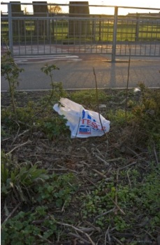
Plastic bag litter on Godsey Lane